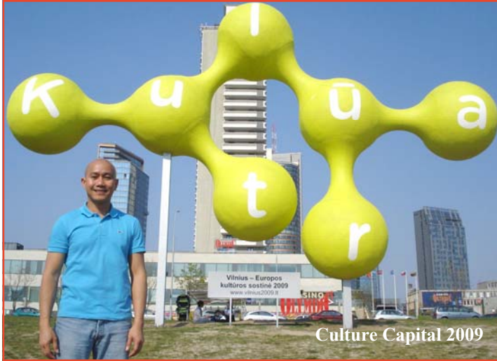
Culture Capital 2009

E very year a city in Europe is chosen by the EU to be the European Capital of Culture. Vilnius, the capital of Lithuania currently holds the coveted title. The designation allows the city to showcase its cultural life and cultural development for a year. Thus, it is the best time to visit since it has a lot to offer to its guests.