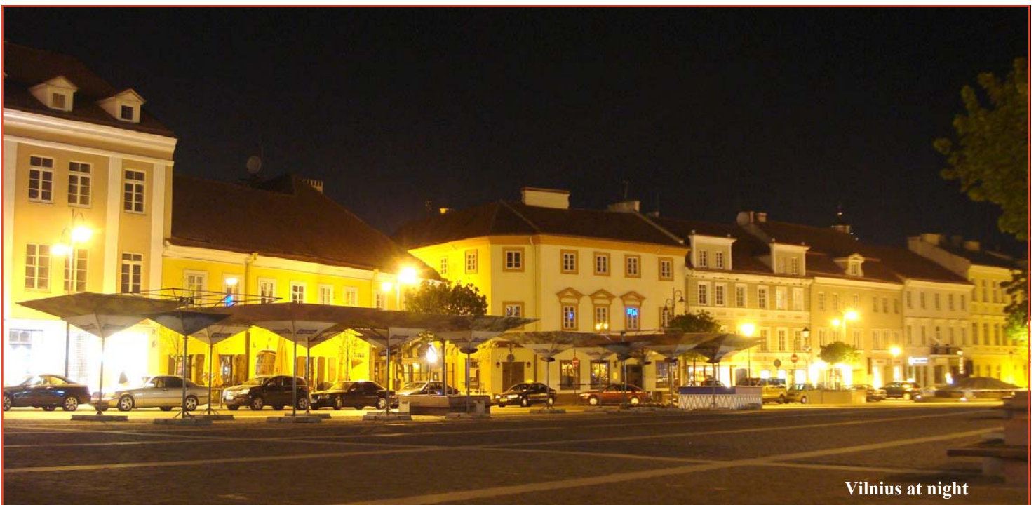
Vilnius at night